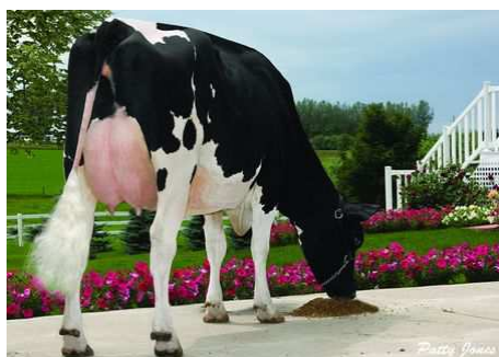
Reevo Yolanda - 2009