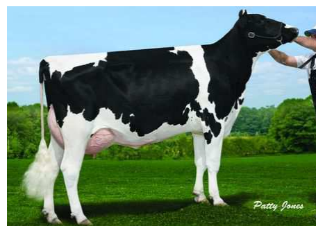
Kelderview Teeoff Mandy - 2009