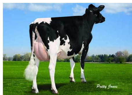
Twincrest Tee Off Nancy - 2009