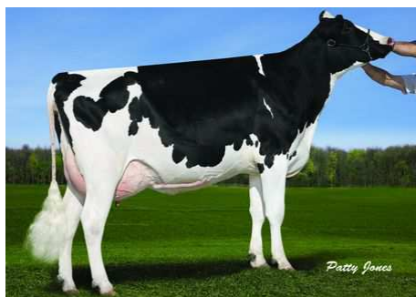
Faralary Annabelle Tee Off - 2009