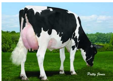
Kelderview Teeoff Mandy - 2009