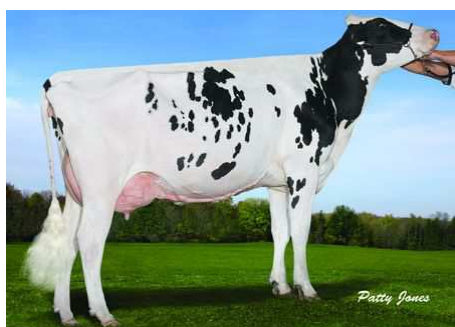
Lenvu Tee Off Nan - 2009