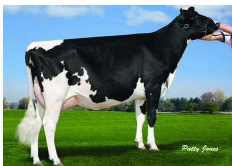
Twincrest Tee Off Nancy - 2009