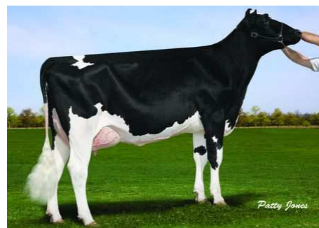
Stonehenge Carly - 2009