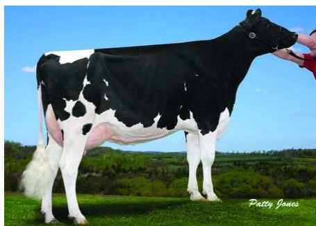
Reevo Yolanda - 2009