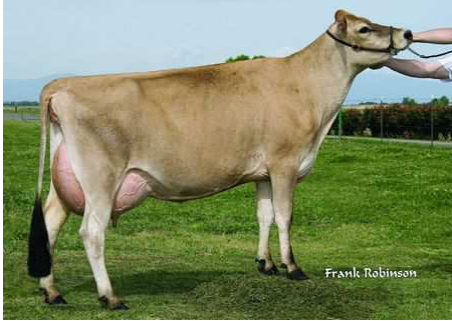
BW Sultan Sheri L889