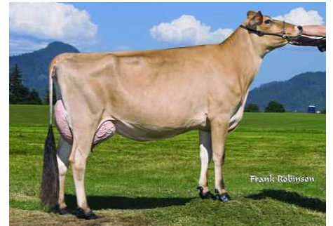
Sunset Canyon Sultan Anthem - 2008