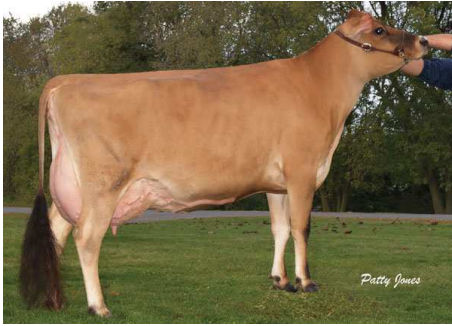
Peninsula Sultan Emily 2004