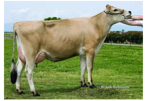
BW Sultan Annie L371