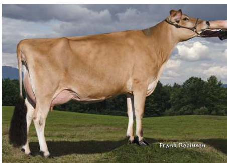
Norval Acres Sultan Jess 2006