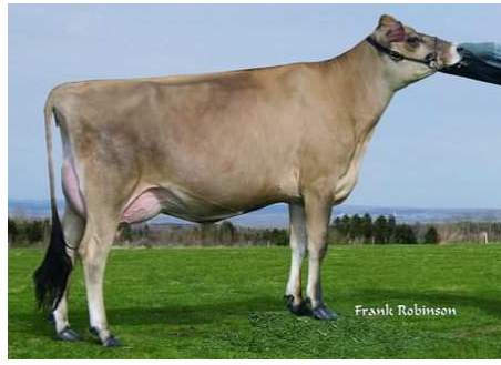
Petitnord Sultan Sibelle