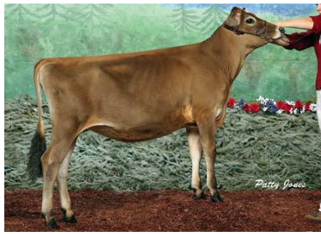
Lencrest Duchess of Dublin 2005