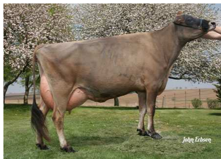
Brenbe Sultan Feather 2005