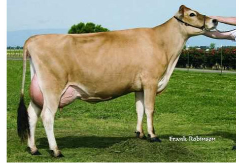
BW Sultan Vera L375