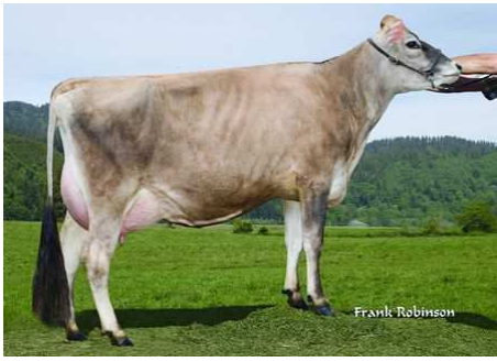
Sun Valley Sultan Poppy