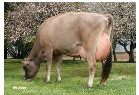
Brenbe Sultan Feather 2005