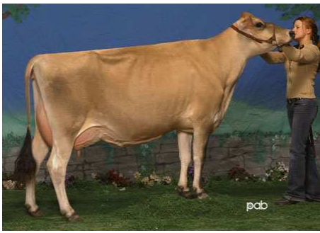
Glen Caro Rosie 5L QIS - 2005