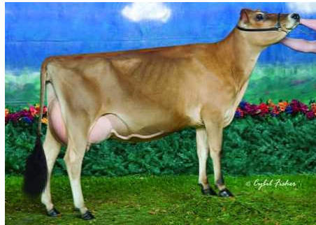
WF Sultan Shadowy