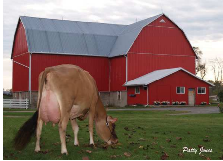
Peninsula Sultan Emily 2004