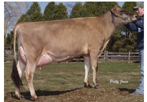
Brenbe Sultan's Pear 2004