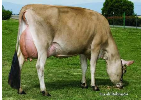
BW Sultan Sheri L889