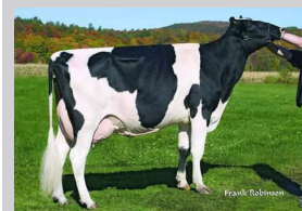
Beaujour Raptor Ralpie