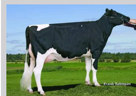
Belan Sunny Raptor