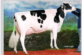
Innislake Luckstar Cadbury