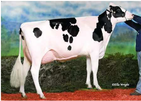
Innislake Luckstar Cadbury - 2008