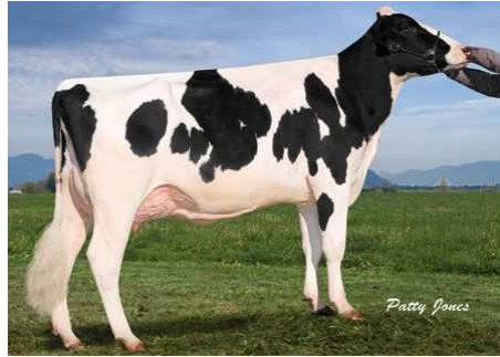
NATURE_GLEN LUCKY STAR 525