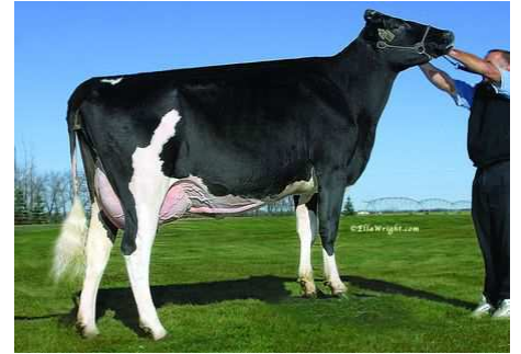
RAVINE_BANK STAR BUST