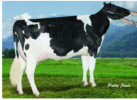
Telford Darleen Lucky Star