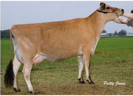
Charlyn Legacy Sasha 2006