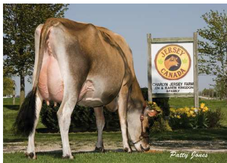
Charlyn Legacy Gennie 2006