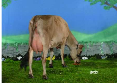
Garhaven Dorray Legacy