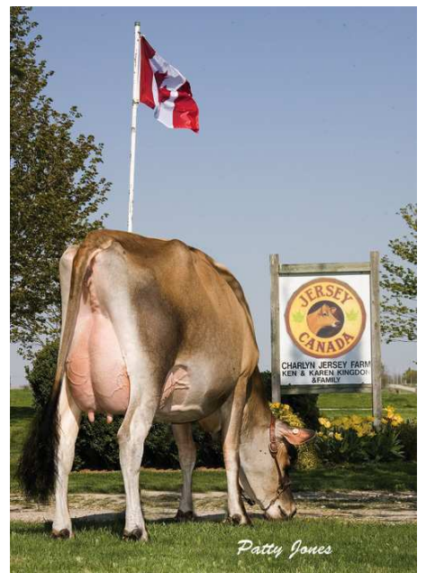
Charlyn Legacy Gennie 2006