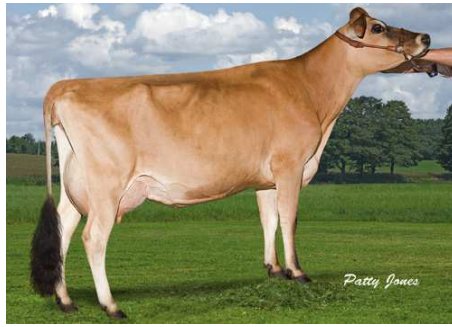
Maughlin Legacy Icicle 2006