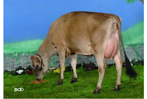
Garhaven Dorray Legacy