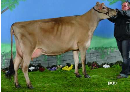
Garhaven Dorray Legacy