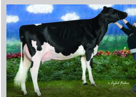
Eastside Lewisdale Gold Missy 2008