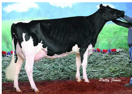
CENTURYHOLM GOLDWYN GREER