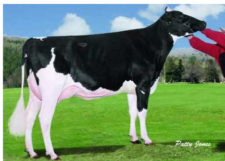
SPENCEHOLM GOLDWYN NATASHA