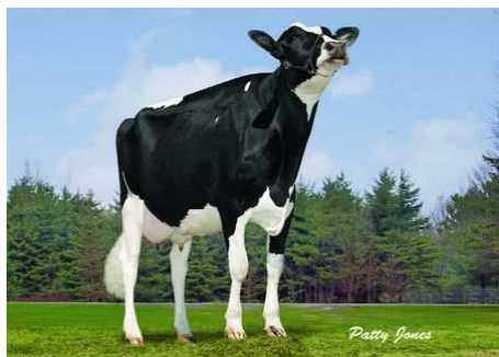
ALGERDALE JOSIE FINAL