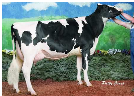
MOUNT AIRY FINAL CUT MAURA