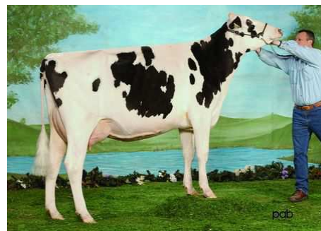
JEWELDALE DALLAS FINAL CUT