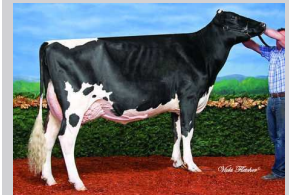
Phillhaven Final Cut Brittany 2009