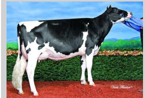
Quality Final Cut Fiscoe 2009

Besättningar: 1726 Dottrar: 3017 Säkerhet: 99% GEBV 10*APR