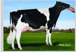
Chanmar Final Cut Becky 2009