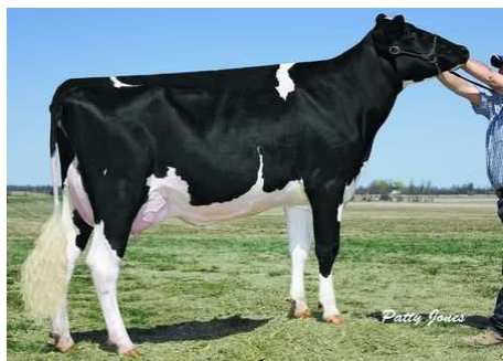
MALLENMAR FINAL FANTASY