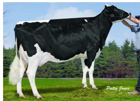
ALGERDALE JOSIE FINAL