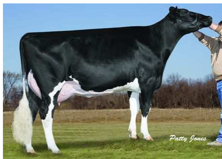
HILLISLE FINAL CUT SUZIE