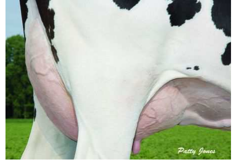
HARBODALE DOLMAN HATTER