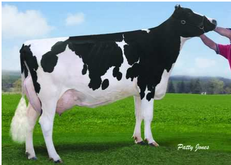
Windy_Pine Dolman Stacey - 2nd Lactation