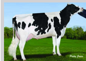
Stantons Dolman S Quire 2010

Besättningar: 2199 Dottrar: 4118 Säkerhet: 99% GEBV 10*APR