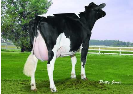
OGALEA 684 DOLMAN