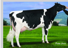
Alpina Dolman Swannie 2009