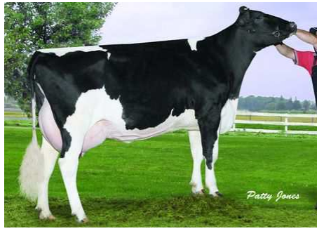
OGALEA 684 DOLMAN