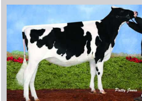
Vintage Dolman Milly 2009