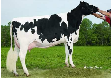
HARBODALE DOLMAN HATTER