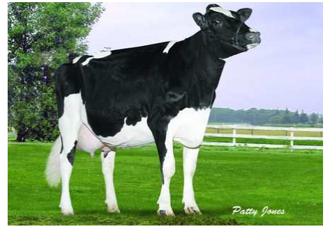
OGALEA 684 DOLMAN