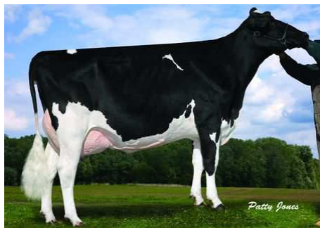
Rolling_Mac Denzel Cecelia - 2008