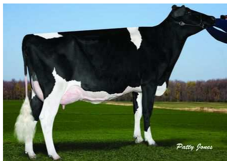
Willrae Denzel Junie - 2008