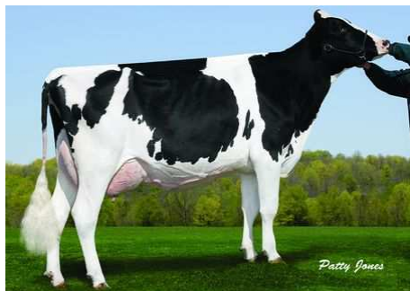
Birdolm Denzel Buggy - 2008