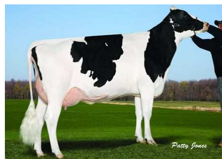
Acmelea Denzel Annabelle - 2008