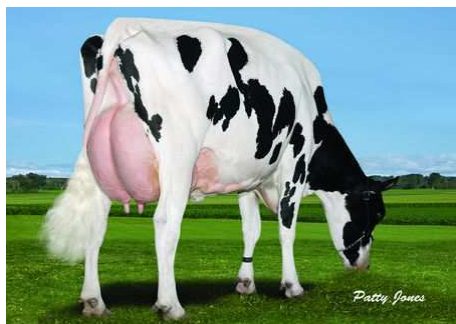
Leehill Denzel Isla - 2009