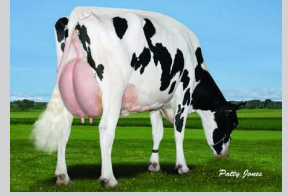
Leehill Denzel Isla