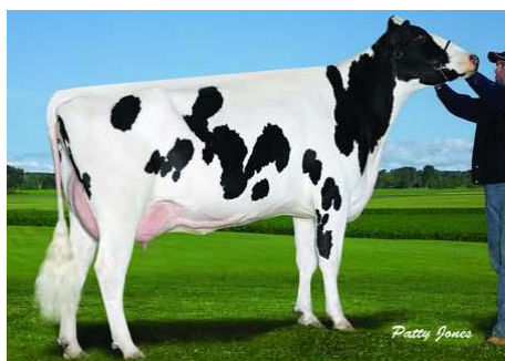
Leehill Denzel Isla - 2008