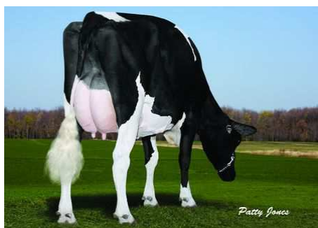
Willrae Denzel Junie - 2008