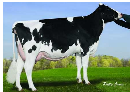
Rybeebar Faye Denzel - 2008