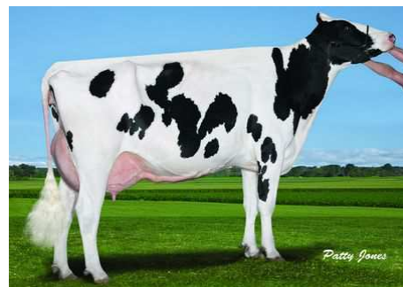
Leehill Denzel Isla - 2009