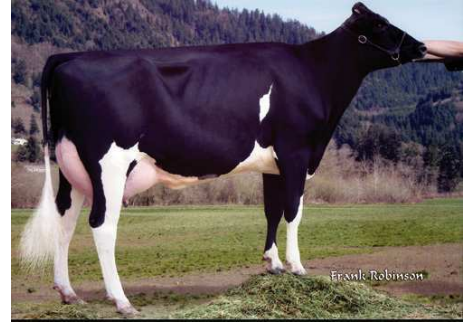
Brownking Buckeye 4246