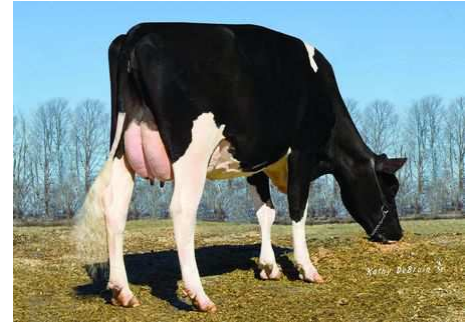
R-E-W Cher - 2008