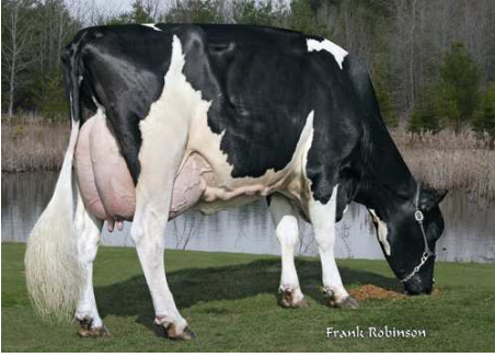
Silveira Buckeye 2863