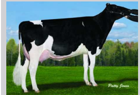
Shoremar Buckeye Diamonds 2009