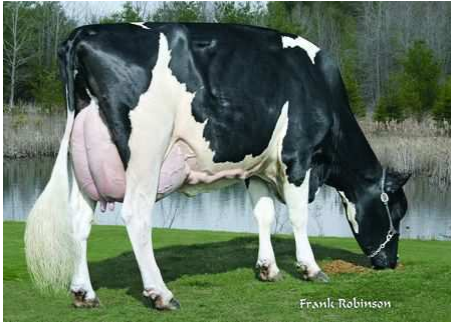
SILVEIRA BUCKEYE 2863