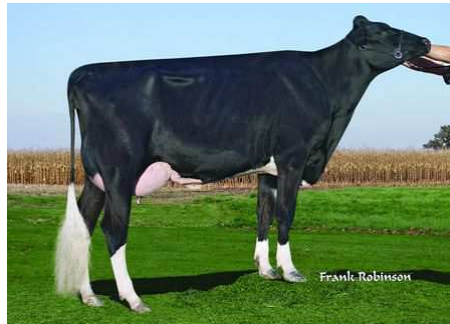
Lactomont Ollie Buckeye - 2008