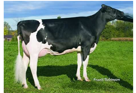
Val-Bisson Buckeye Niagara - 2008