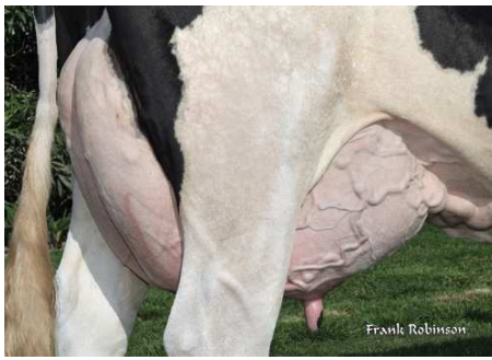
Silveira Buckeye 2863