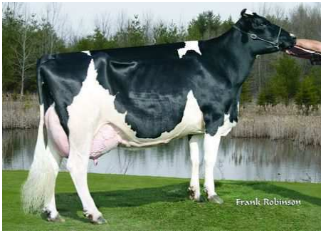
SILVEIRA BUCKEYE 2863