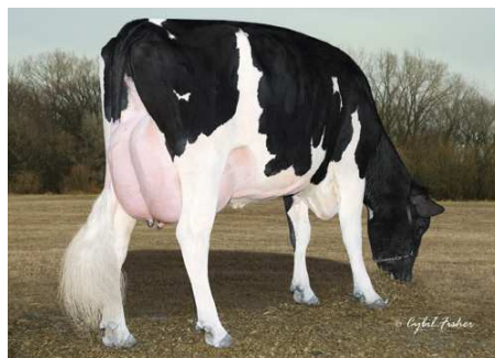
Lismore Buckeye 7356 2006

(l to r) Lismore Buckeye 7356, Brownking Buckeye 4246, Dalbom Buckeye 718 - 2006