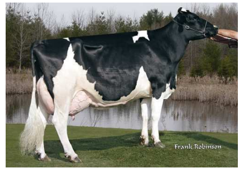
Silveira Buckeye 2863