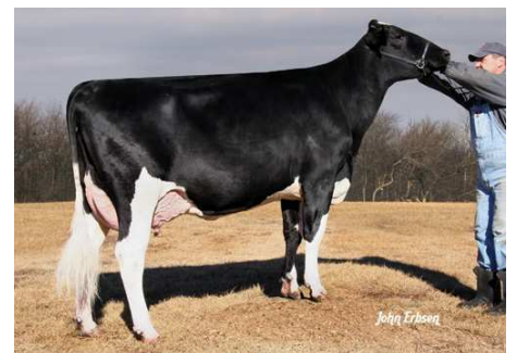
Dalbom Buckeye 718 2006