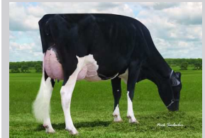
Bur-Wall Buckeye Gigi 2009