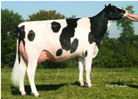
Shea-Hi Buckeye Heather - 2008