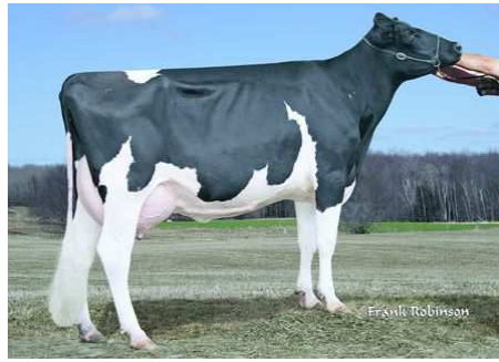
VISTA BUCKEYE 1327