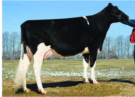
R-E-W Cher - 2008