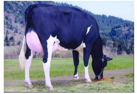
BROWNKING BUCKEYE 4246