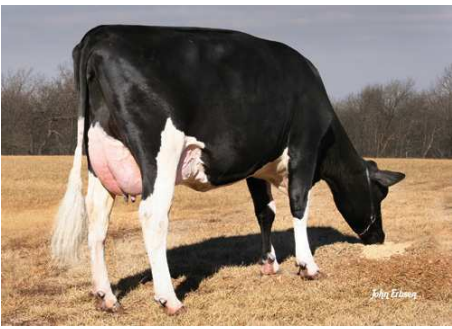
Dalbom Buckeye 718