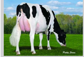
Mapel_Wood Buckeye Darla 2009