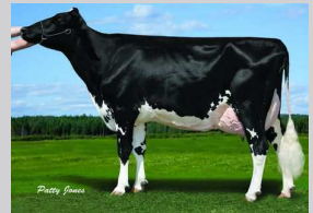
Savale Maryanne Ashlar 2008