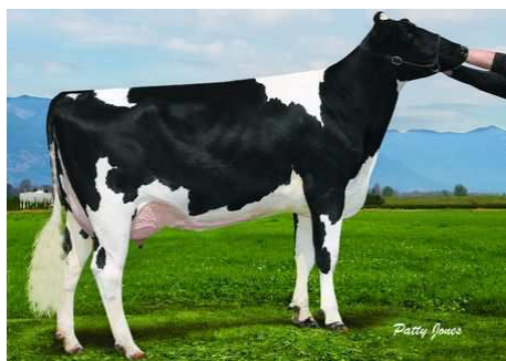
BUK001 Ashlar 323