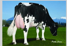
Coanwood Ashlar Alice 2008

Besättningar: 43 Dottrar: 57 Säkerhet: 86% GEBV 10*APR