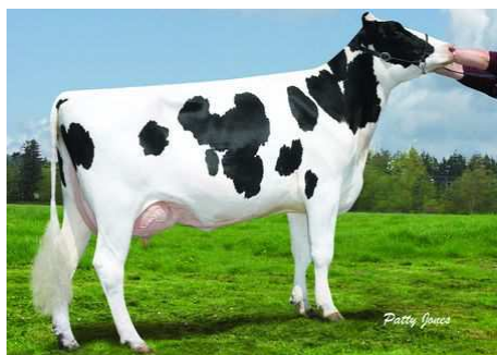
Nature Glen Ashlar Karrie 1075