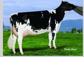
Struys Ashlar Wallace 2008