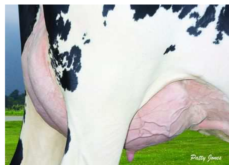
Struys Ashlar Wallace