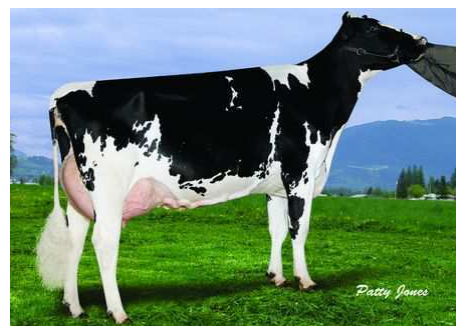
Struys Ashlar Wallace - 2008