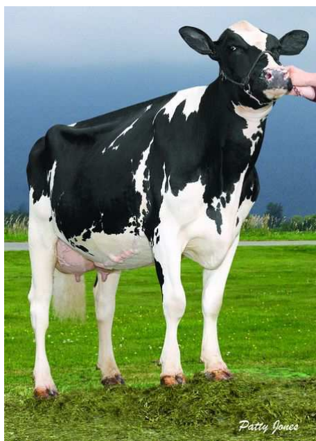
Struys Ashlar Wallace