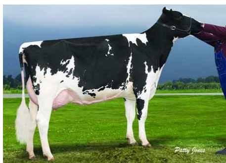
Struys Ashlar Wallace